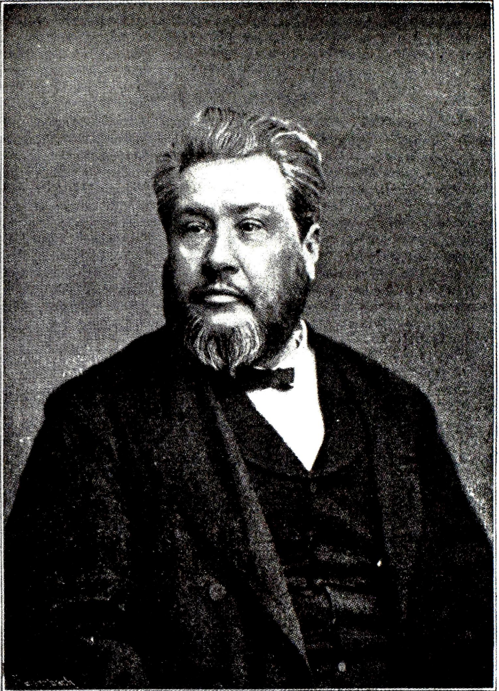
PASTOR C. H. SPURGEON.

BORN AT KELVEDON, ESSEX, JUNE 19TH, 1834.